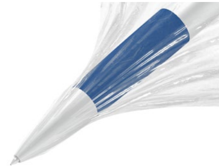
Puncture and tear resistance

Contact us at stretchfilms@berryglobal.com or 1.877.662.3779